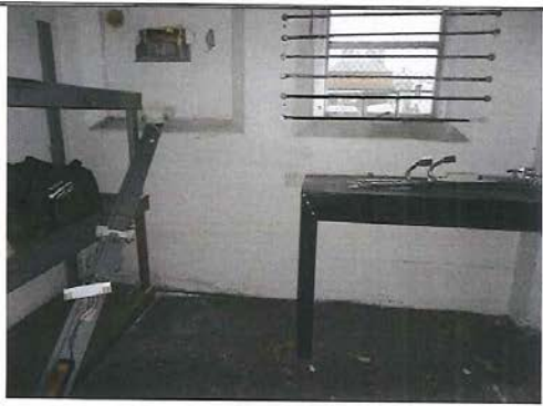
Photo 24 Basement