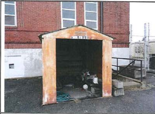
Photo 27 Storage Shed