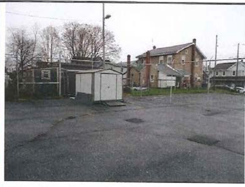
Photo 26 Lawn mower shed