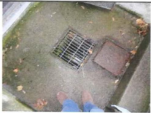
Photo 28 Storm Drain in exterior stairwell